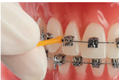
Twist to remove holder