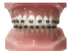
SLX 3D Typodont