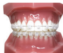
SLX 3D Clear Typodont